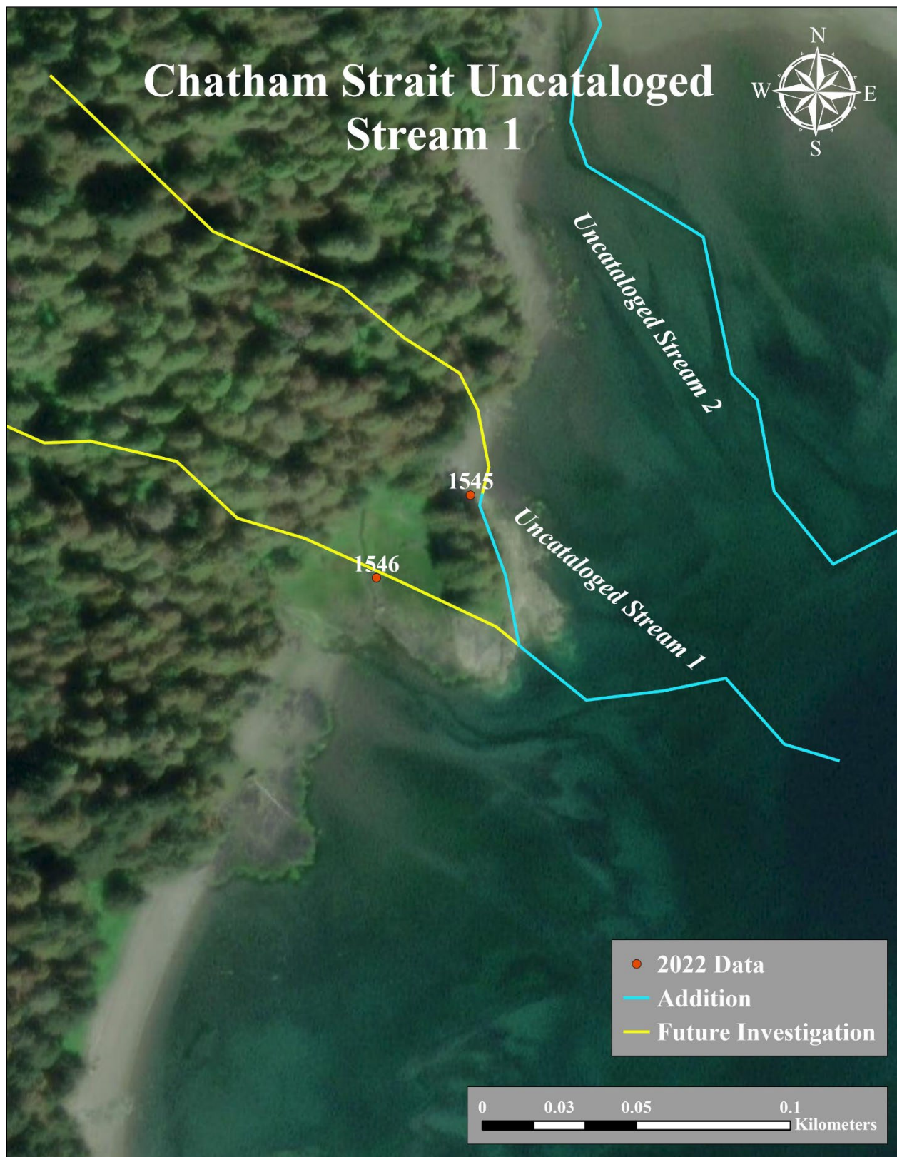
Figure 4.—Uncataloged stream 1 addition map.