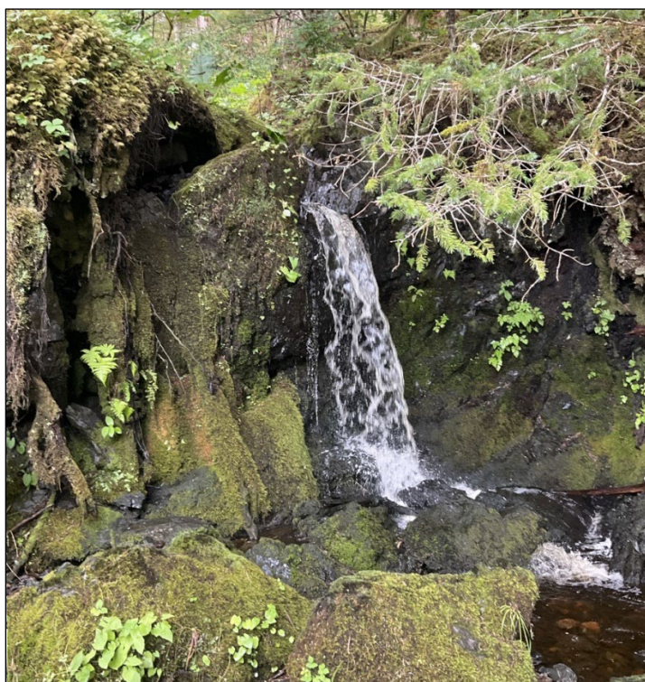
Figure 2.–Falls at waypoint 1545.