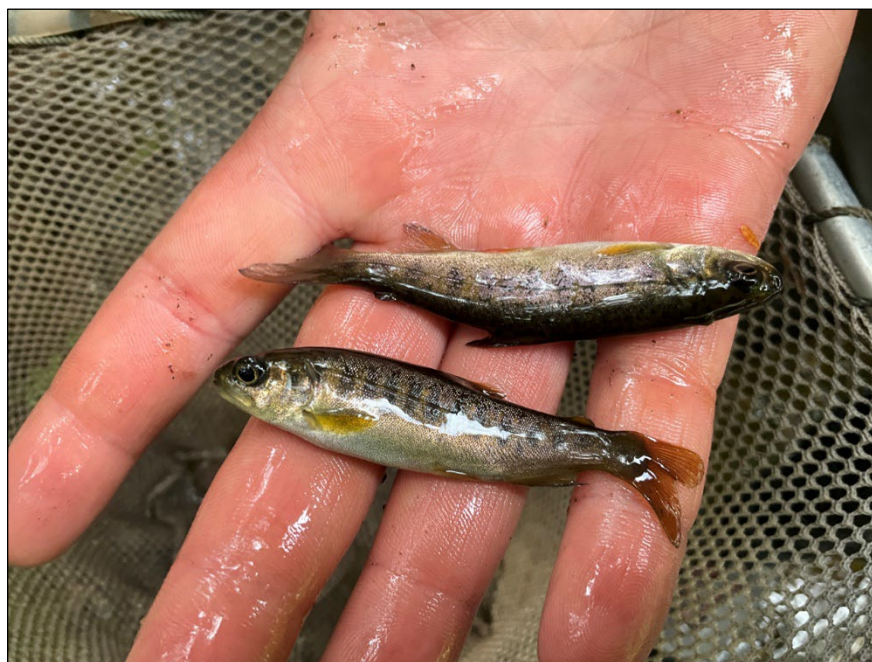
Figure 1.—Juvenile coho salmon captured at waypoint 1545.